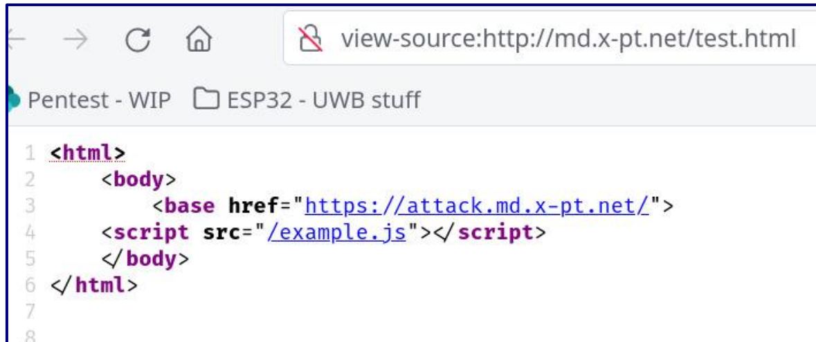
Figure 5 - The source code for the webpage whose error message is shown above.

Content-Security-Policy "script-src 'self' md.x-pt.net;";